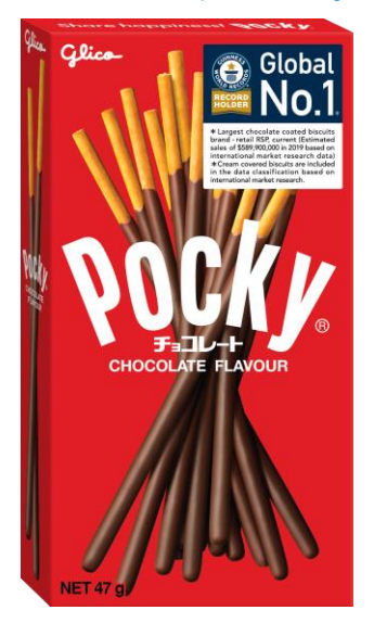
<Special Packages with the GUINNESS WORLD RECORDS record holder logo from Around the Globe>