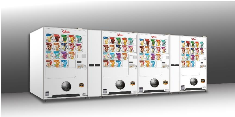
"Seventeen Ice" vending machines