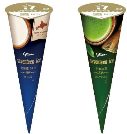
Seventeen Ice Hokkaido Milk